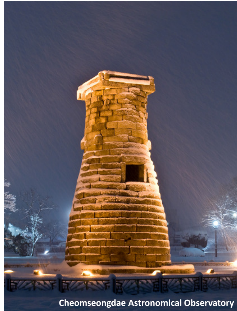
Cheomseongdae Astronomical Observatory