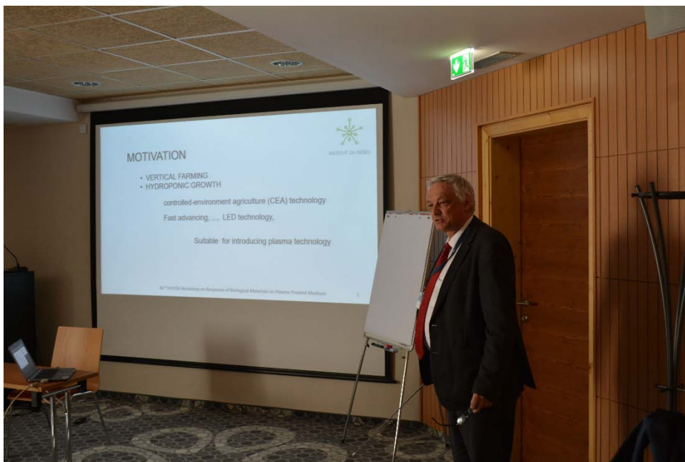
Prof. Slobodan Milosevic presented challenges in application of plasma-treated liquids in modern agronomy.