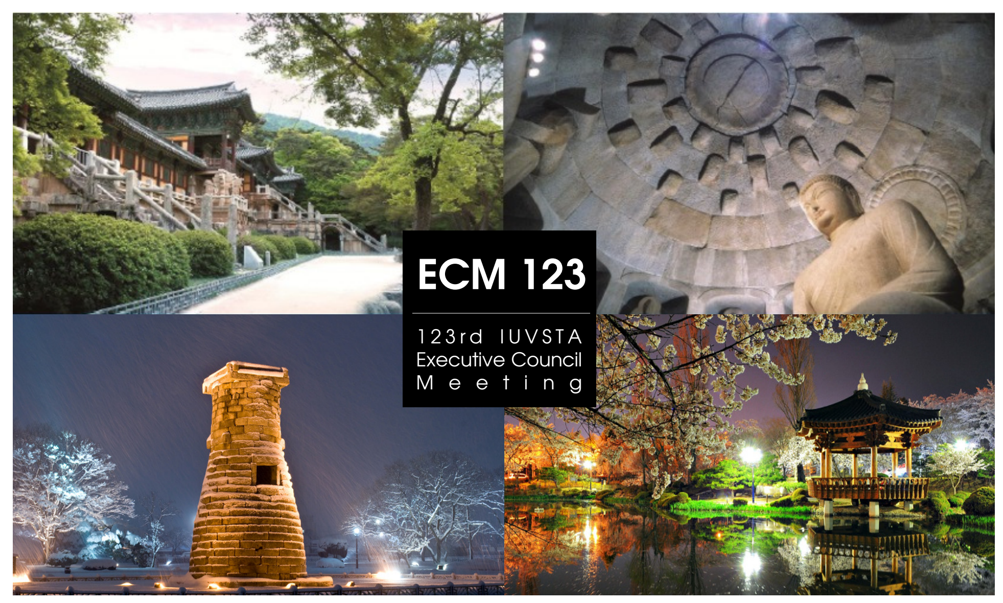
For further information, please visit: www.ivc20.com/sub01_6.php