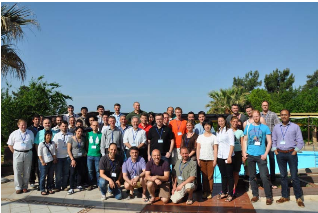
Participants in the School

a difficulty to follow the practical sessions and proposed to give more time to tackle the exercises in such a school organized in the future. Overall, it is considered as a very successful school fulfilling all its objectives. The program and pictures of the School can be seen at the web-site: http://iuvsta-school2015.mie.uth.gr/ .